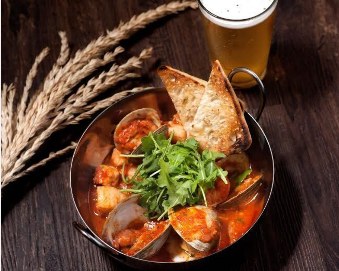
Shown: The Bedford Plate